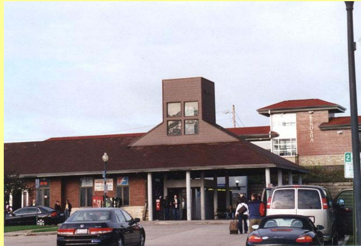
The Kenosha Depot in October 2009.