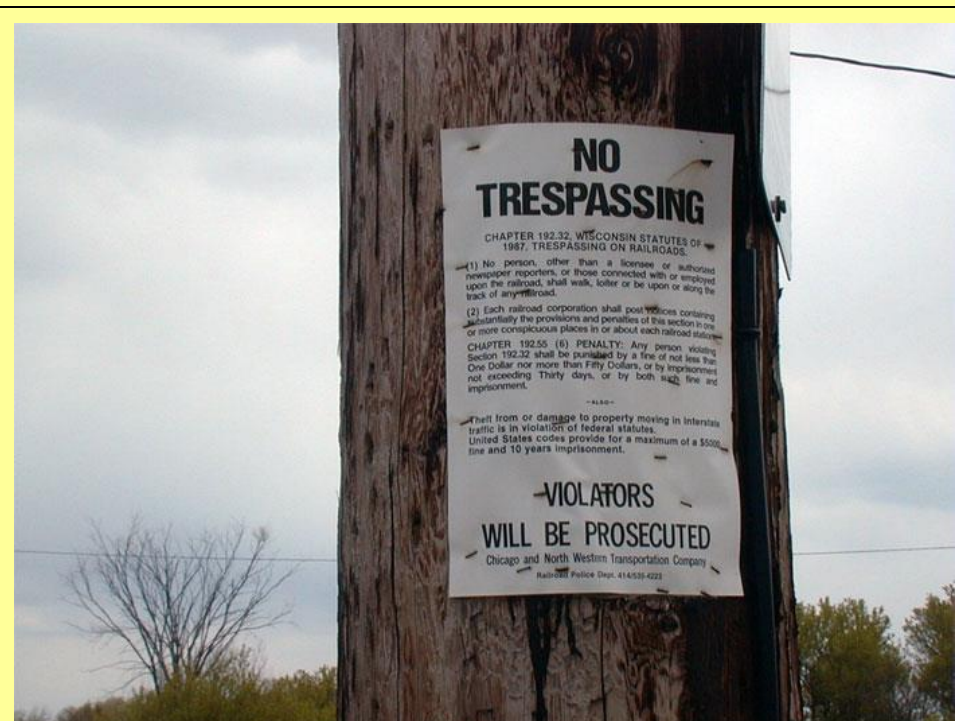
Another one of those signs – this one at Jefferson Junction. They may be cardboard, but the sure are durable!