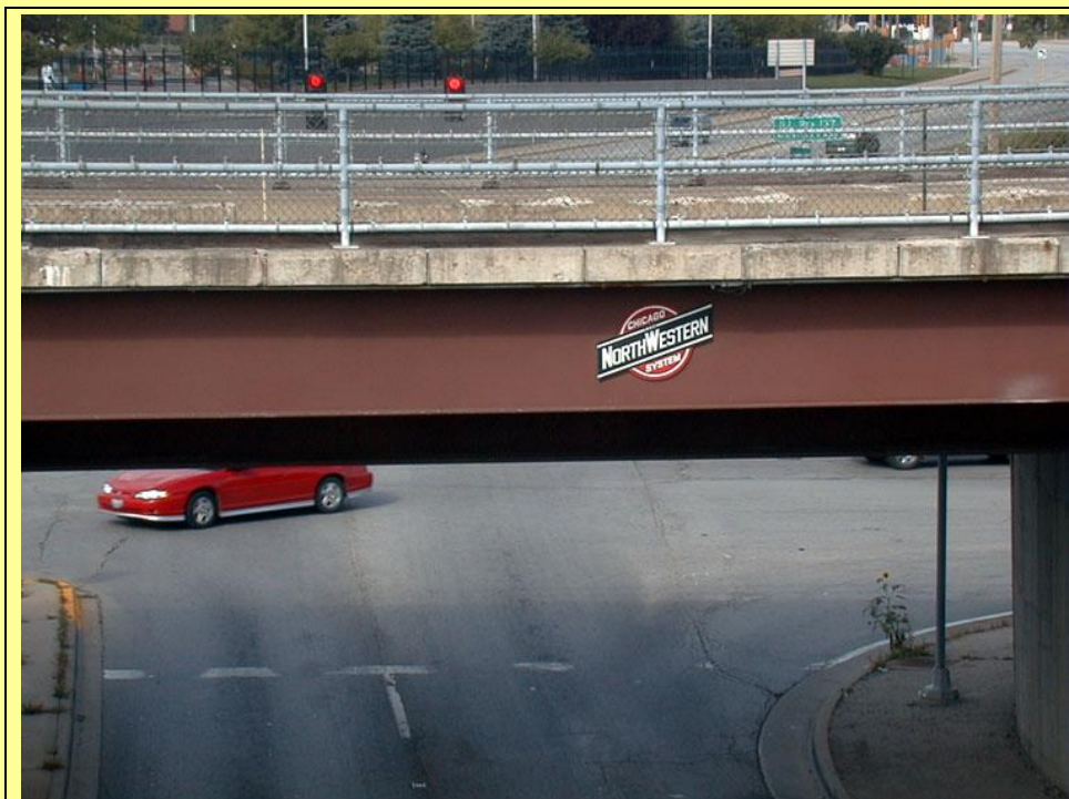
On the bridge over Route 137 just north of the Great Lakes Station. There's one on the other side of the bridge, too.